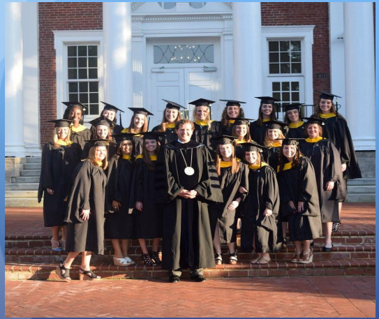
2016 CSD graduates with the president of the University