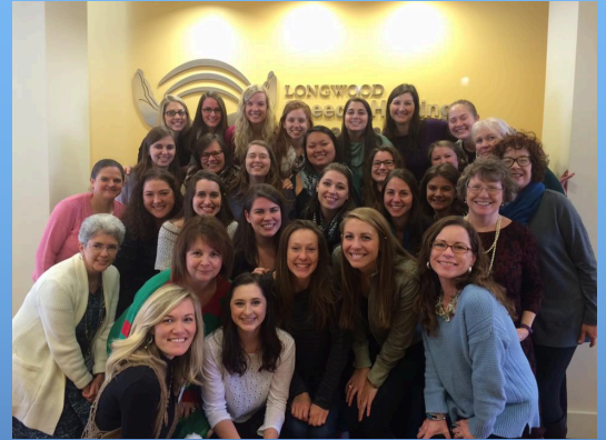
2nd year graduate students finish the fall semester strong with the help of CSD faculty.